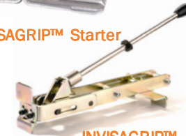
INVISAGRIP™ Installation Tool